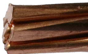
Cut made with special M&P scissors.

7 Insert the connector and fasten accurately until the o-ring present in component A, will be pressed against the connector body. Inside, the rubber component C (pic. 1) will expand, granting optimal sealing against moisture and a perfect contact to ground.