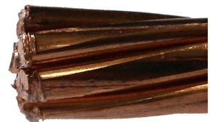
Common scissors: remember to use a file in order to remove the copper in excess.

Make sure to follow the stranding direction.